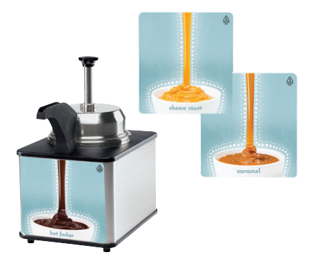
Supreme<sup>™</sup> Hot Topping Merchandiser

The Supreme™ hot topping merchandiser dispenses from a 2.8 L stainless steel jar or manufacturer's #10 can using a stainless steel pump. Unit includes a kit of (3) magnetic merchandising signs: Caramel, Cheese and Fudge (kit p/n 86749).